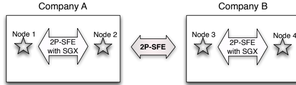
Fig. 1: Half and Half. In this usage, we convert SGX-supported 2P-SFE values to standard 2P-SFE values and back in order to take advantage of the speed of the combined form when the trust model is acceptable and still allow for a stronger model when the trust model of SGX-supported 2P-SFE is not acceptable (say, the user does not trust Intel when using a public network).